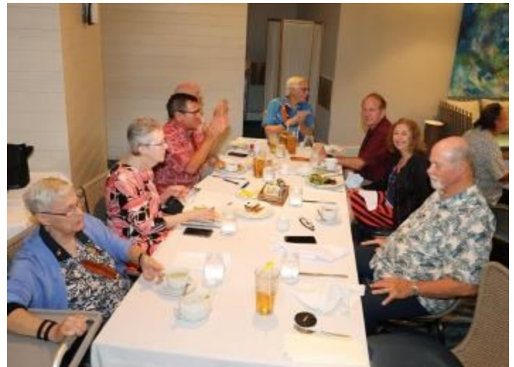
In this Wednesday Nov. 6 meeting we had a good turnout of 34 members and guests, so we were over the quota of 30!