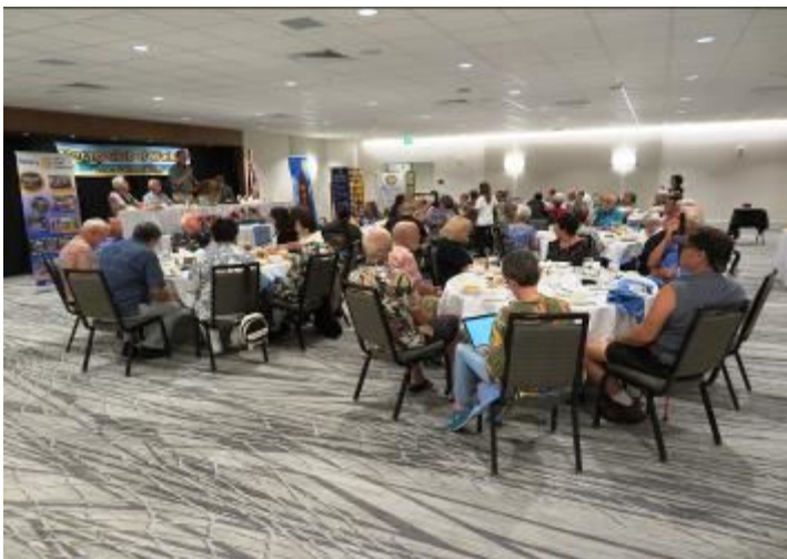
Good turnout today, thanks to the 20 Seniors!

Respectfully submitted, PP/PE Carol Riley