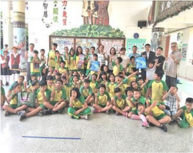
Waikiki Rotary and Kaohsiung Central Rotary Clubs visited the renovated library, a Global Grant Project and donated books to over 50 children in Wuhan Elementary School