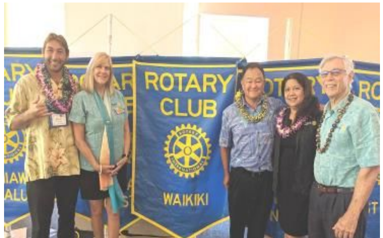
Our VIP group at the District Conference.